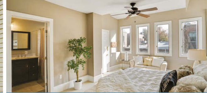
SPACIOUS MASTER BEDROOM