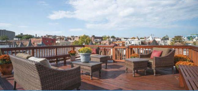
STUNNING COMMUNITY ROOF DECK