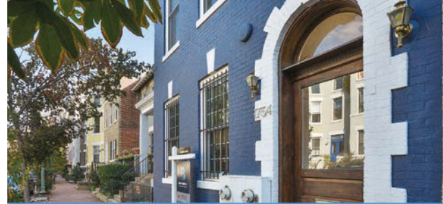
CHARMING TREE-LINED STREET